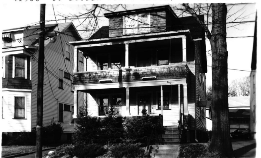
board of Realtors of the Oranges and Maplewood